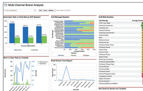
Figure 2: Actionable insights

All Approved Email activity, including email sends and customer interactions like open rates and clicks, is captured and stored automatically within Veeva CRM. This information, combined with interaction data from other channels, provides a comprehensive and reliable database of customer behavior across channels and users. Brands can learn which promotional materials are most effective by monitoring preferences, down to the individual customer level. Tracking content and message effectiveness helps companies respond quickly to customer needs and business changes.