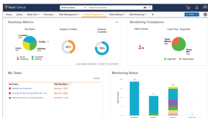
Figure 2: Get visibility to enrollment progress, monitoring visit status, and MVR compliance