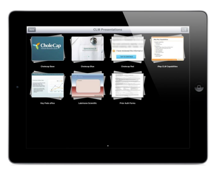
Figure 1: Digital Presentation Library

Veeva CLM is a scalable, closed loop marketing solution that helps your field force create richer face-to-face customer interactions and provides detailed feedback to your marketing and sales teams. Customer data from CRM is seamlessly linked with presentations to deliver personalized content, boosting the impact of each customer engagement.