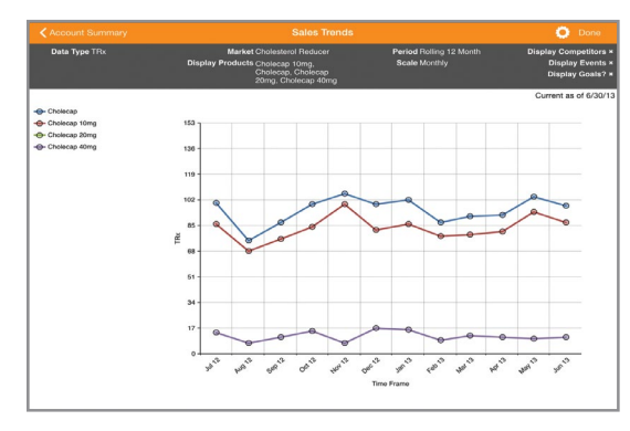
Figure 2: Actionable Insights

Accurate data is at your fingertips with a seamless connection to Veeva CRM's cloud-based database for prescriptions, sales, and customer interaction data.