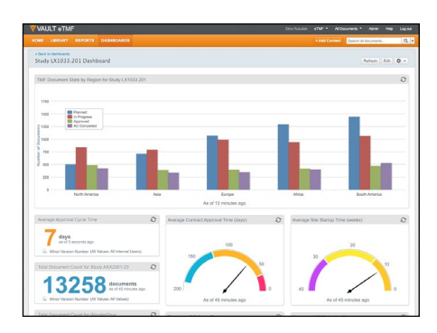
Interactive dashboards translate insights into action