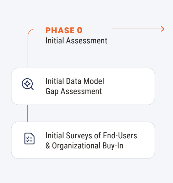
FIGURE 3: Content effectiveness study phases

Senior Associate Director of Content Strategy and Impact, Boehringer Ingelheim