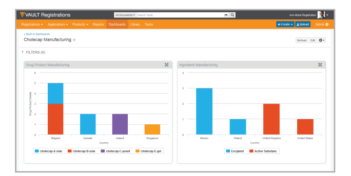
Figure 2. Easily find where products are manufactured or sold.

It is critical to know where your products are registered, what commitments are outstanding, and which registrations would be impacted by a potential manufacturing change. Vault's real-time reporting and dashboards help answer questions about registration status and submission readiness.