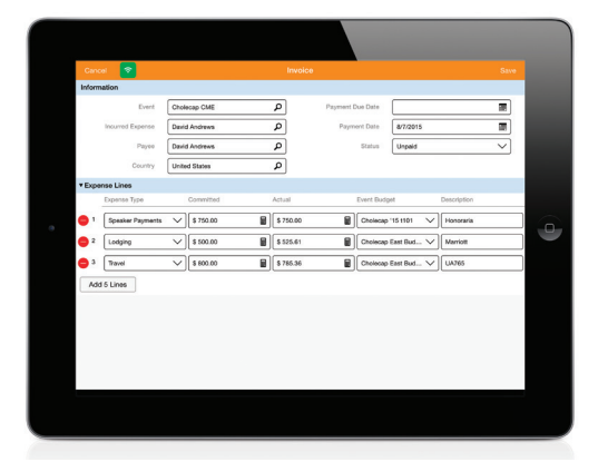
Invoice data entry

With many disparate systems in use across event types and geographies, however, it is nearly impossible to efficiently track speakers and spend. Poor KOL usage and limited spend visibility impact compliance and event success. Bringing the best speakers together with the right audience is challenging—and difficult to coordinate across stakeholders.