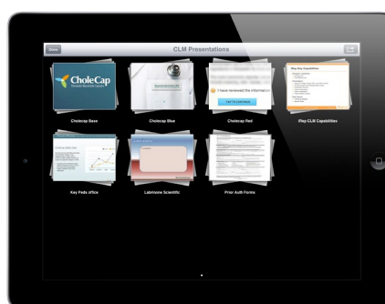
Figure 1: Digital Presentation Library

Vevea CLM is a scalable, closed loop marketing solution that helps your field force create richer face-to-face customer interactions and provides detailed feedback to your marketing and sales teams. Customer data from CRM is seamlessly linked with presentations to deliver personalized content, boosting the impact of each customer engagement.