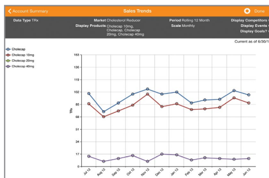
Figure 2: Actionable Insights

System configuration is quick with easy-to-use yet powerful system administration. Updates are made centrally and downloaded to all users without the need for additional processes or coding to manage configuration, security, and data sharing rules.