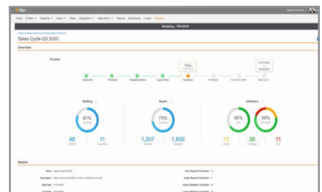
Generate reports on modeling, production, and historical data