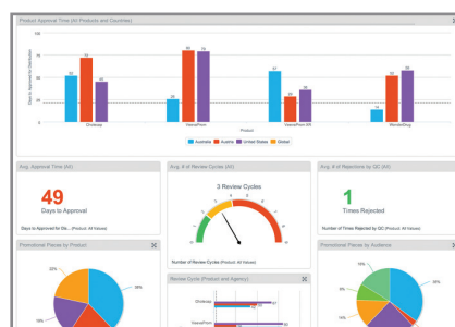
Figure 3: Actionable insights

Flexible, self-service, time-based reporting helps identify bottlenecks and areas for process improvement. Reports include average number of review cycles by product or agency, status of items by product, agency or market, and average number of review cycles before approval. Reports are easily configurable, so users can create or adapt them to their needs. The unique "Where Used" report tracks where claims are used across commercial content.