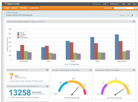
Interactive dashboards translate insights into action