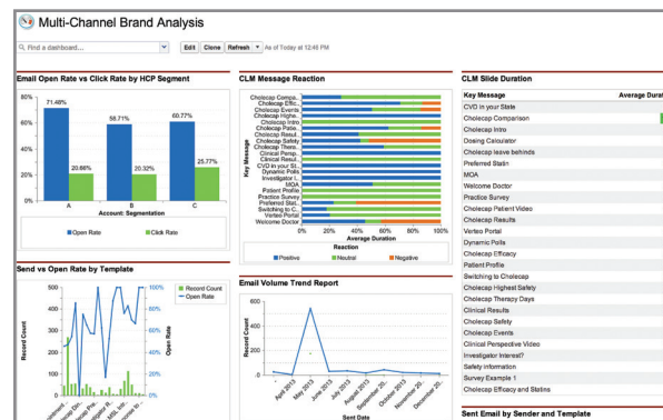
Figure 2: Actionable insights

Understanding customer needs and behavior is key to marketing success. Learning what customers value and how they respond to messaging and services can help brand teams design better, more relevant materials. Companies can now optimize their promotional spend while creating a better customer experience. Because Engage is a part of Veeva's Commercial Cloud, rich customer insight is automatically captured from each interaction and seamlessly updated in Veeva CRM, in real-time. Veeva can track interactions of identified and anonymous customers for marketing analysis, allowing marketing and sales to respond to customer needs quickly and effectively.