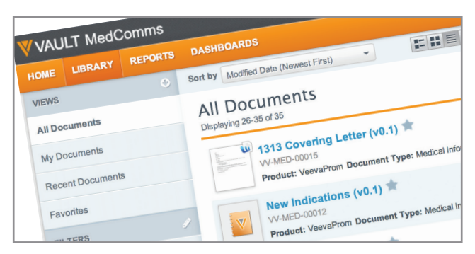
Figure 1: MedComms content repository

When medical content is stored in multiple systems, copying and dispersing content leads to inefficiencies, broken chains of custody, and users accessing outdated versions. With true browser-based access, easy-to-configure single sign-on (SSO), and an open, published API to integrate with other systems, Vault MedComms can be a central reference for global medical content management.