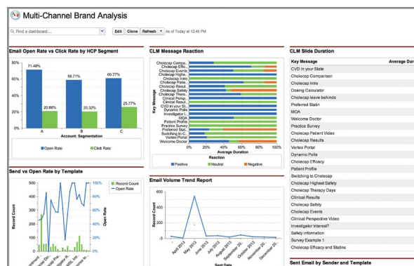
Figure 2: Actionable insights

Learning what customers value and how they respond to messaging can help brand teams design better, more relevant materials. With Engage for Portals, companies can now optimize their promotional spend while creating a better customer experience. Rich customer insight is automatically captured from each interaction and seamlessly updated in Veeva CRM, in real-time. Veeva can track customer interactions of identified and anonymous customers for marketing analysis, allowing marketing and sales to respond to customer needs quickly and effectively.