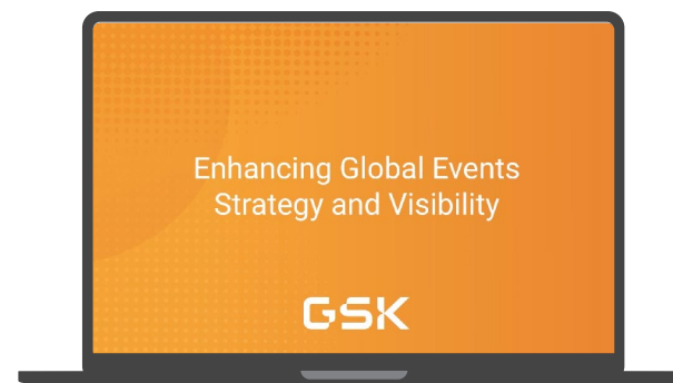
Figure 1: GSK integrates its global events strategy with the customer journey ( watch video )

Traditionally, companies faced significant barriers to adopting digital capabilities and orchestrating interactions. They have been limited by horizontal technology that does not allow for globally harmonized processes across functions and channels. Whether physical or virtual, events have traditionally been managed with multiple disparate tools. This fragmentation has made it difficult to capture data from online interactions and marry it with insights from other solutions and activity channels. To plan and execute more effective events and create the right mix of event types, companies now require a unified approach that brings events out of their silo and incorporates them into a complete customer view [Figure 1] .