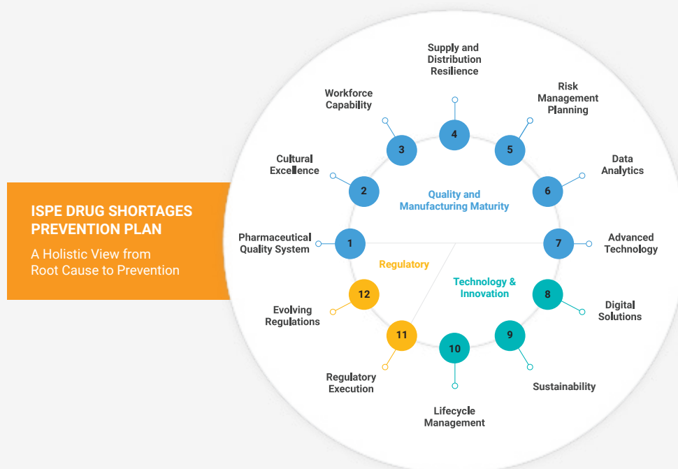
FIGURE 1. PREVENTING DRUG SHORTAGES: BEST PRACTICES ACROSS FUNCTIONS

European regulators launched similar efforts in 2016 and issued guidance 6 in 2023. Its goal is to help marketing authorization holders, wholesalers, distributors, and manufacturers optimize their response to drug shortages resulting from GMP noncompliance. It also includes best practices learned during the COVID-19 pandemic.