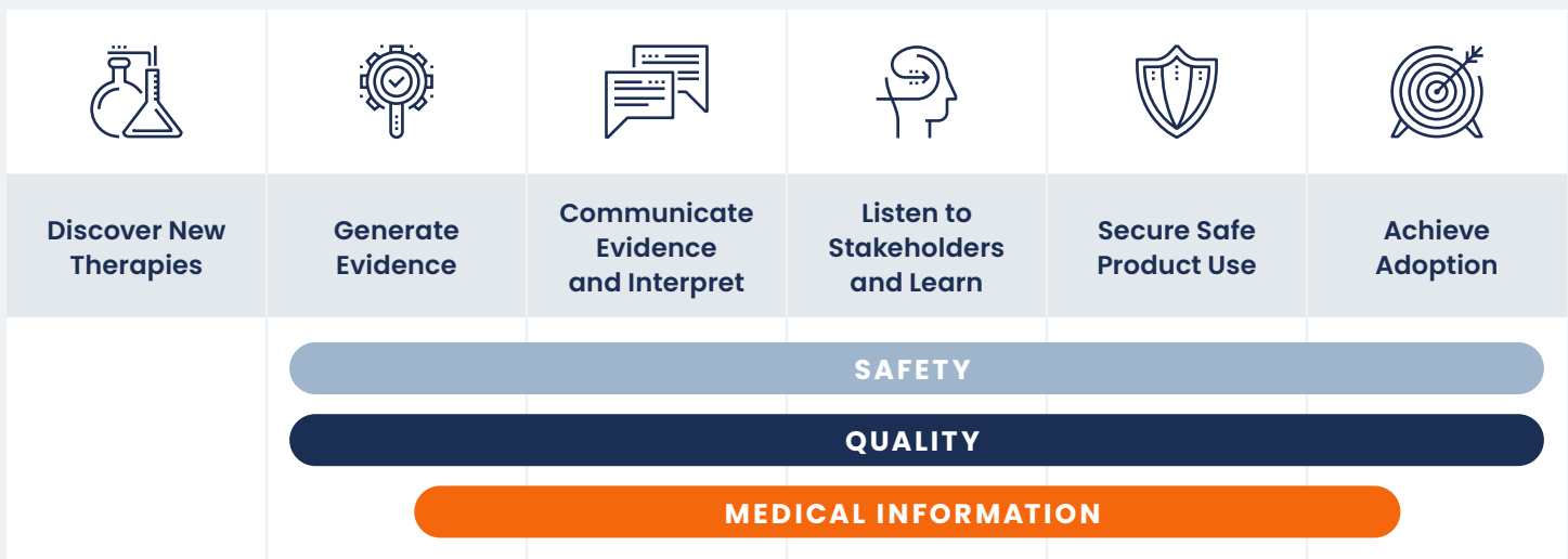
FIGURE 1: Medical Information, Safety, and Quality Activities

When data and technology platforms are disconnected across functions, the time spent reconciling these tasks is critical time lost, not just for HCPs and patients but for teams managing high case volumes across products and geographies.