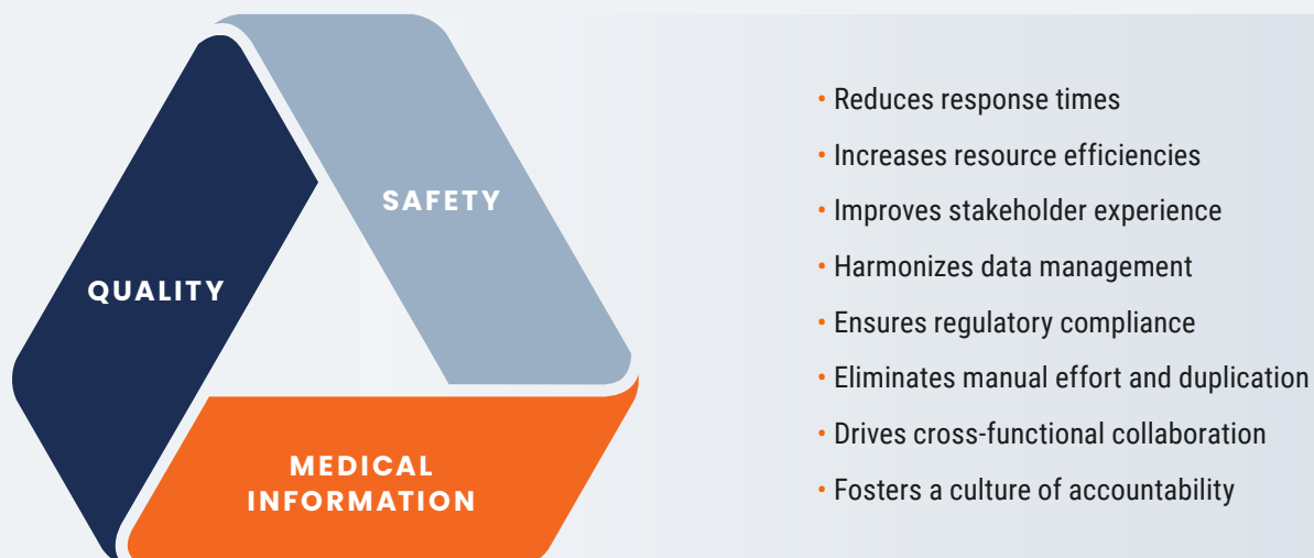
FIGURE 2: Benefits of Connecting the Critical Triangle