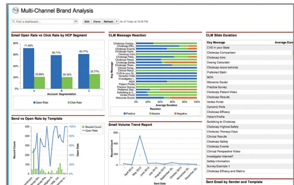
Figure 2: Actionable insights

All Approved Email activity, including email sends and customer interactions like open rates and clicks, is captured and stored automatically within Veeva CRM. This information, combined with interaction data from other channels, provides a comprehensive and reliable database of customer behavior across channels and users. Brands can learn which promotional materials are most effective by monitoring preferences, down to the individual customer level. Tracking content and message effectiveness helps companies respond quickly to customer needs and business changes.